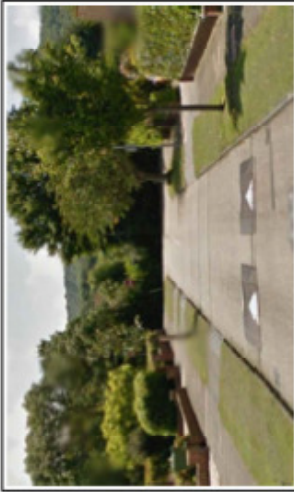
Example of speed cushions. To be used to maintain slower traffic speeds.